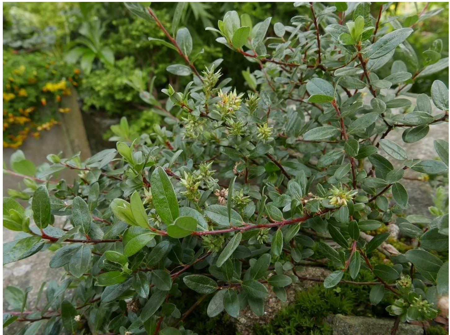
These Salix flowers look to be producing seeds which I will sow and be interested to see if I get any hybridisation as I have a number of species and forms growing through each other