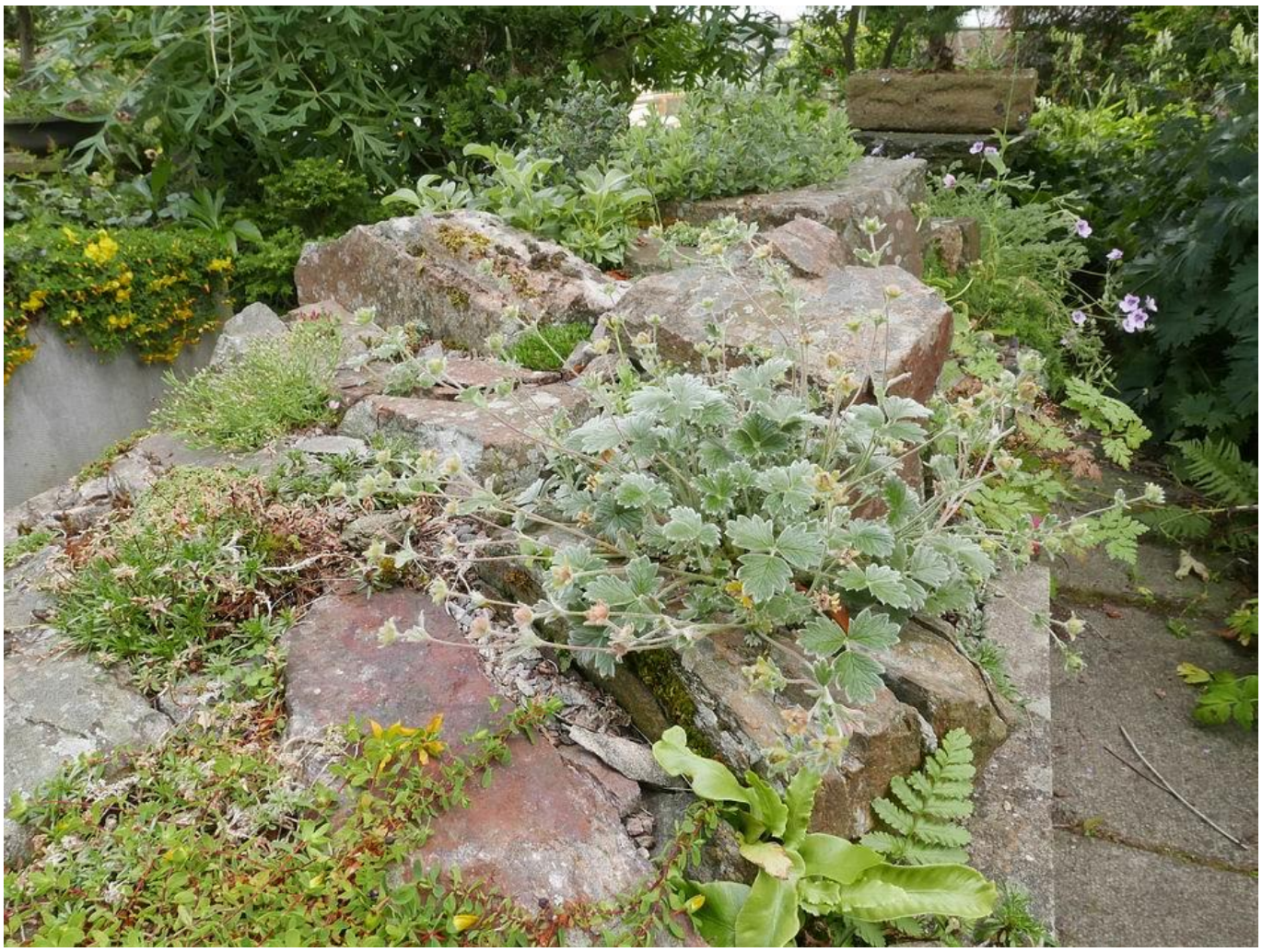
Potentilla pulvinaris forming seed.