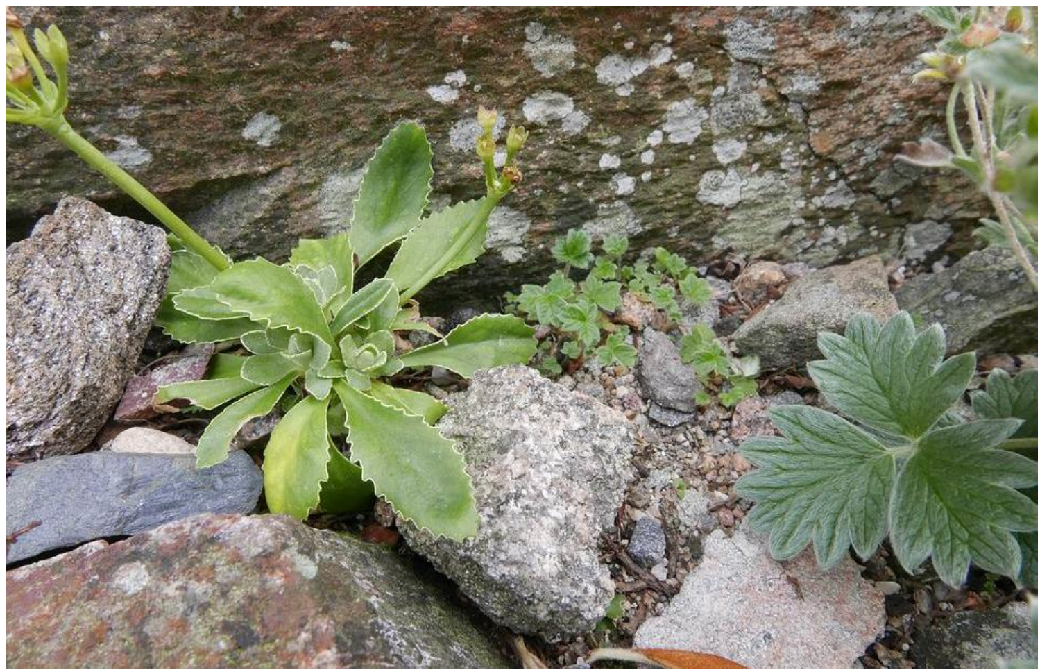
A group of Potentilla pulvinaris seedlings germinating alongside the parent plant.