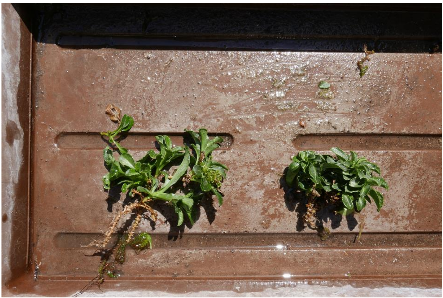
Campanula nitida cuttings.

Plants can be increased by taking cuttings, which retains the characteristics of the parent. Sometimes when I cut off sections of stems for cuttings there are already a few roots forming - in those cases I can place them directly into a box of sand where they will quickly form well-rooted plants as long as they are kept shaded and moist – those with no roots are placed in the mist unit.