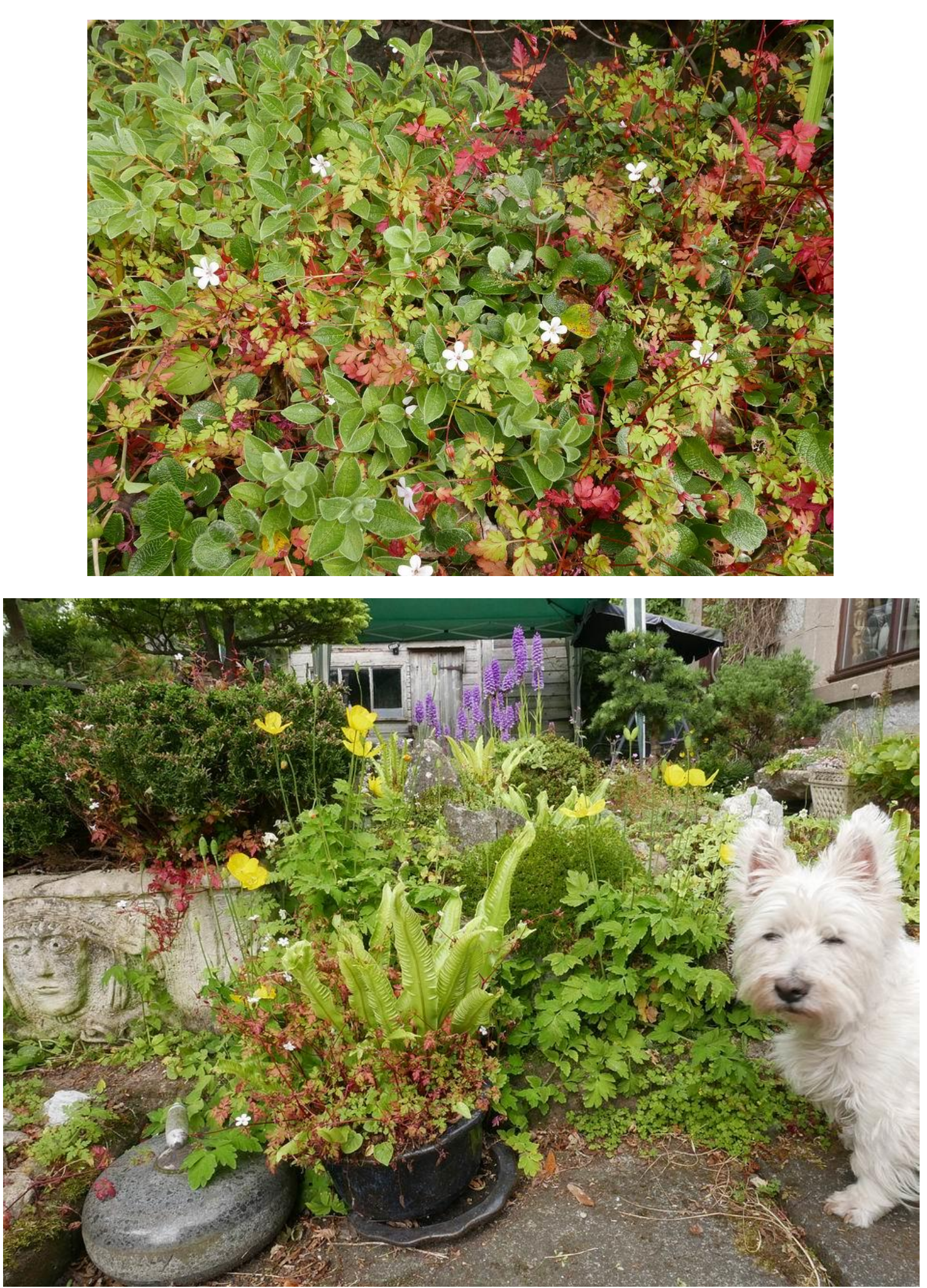
Molly inspects the troughs which are enhanced by the self seeding Meconopsis cambrica and Geranium robertianum also note that the Dacylorhiza in the background are still in good colour.