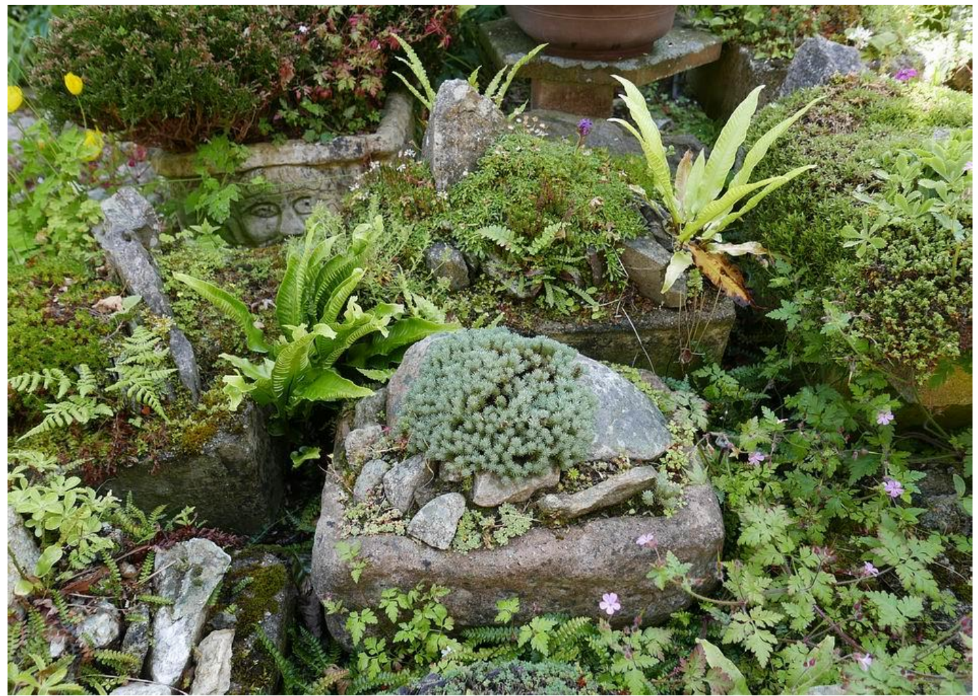
Celmisia argentea growing happily in a small trough – ferns also spore around and depending on how they will fit in with surrounding plants we decide whether they can stay or need to be removed.