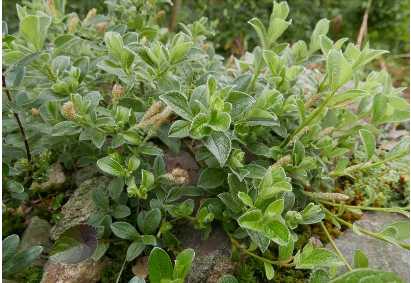
Continually cutting back the growths has also produced a succession of flowers these in the summer are well out of season.

These were cuttings that I took last year: they went through the exact procedure described above before being planted out into one of the slab beds. To encourage branching and keep them compact I have been continually cutting back the new growth and as I do not like to waste material I used the trimmings as cuttings - that is what produced the excess plants that I have potted up.