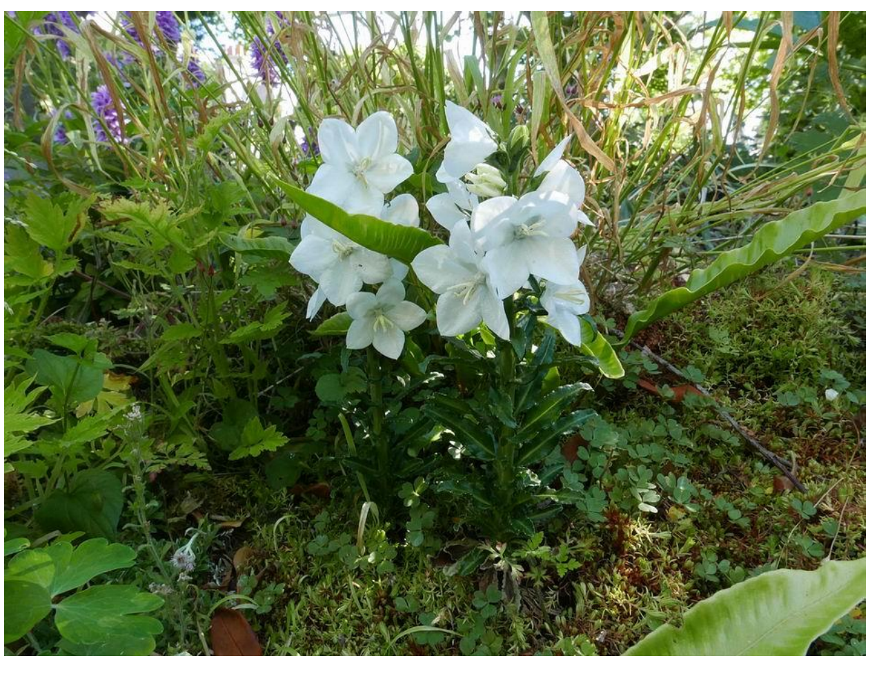
White and violet forms of Campanula nitida

Apart from the obvious colour of the flowers there is a slight variation in the form of the dwarf plants mostly in the shape of the flower – some are very flatfaced, sometimes to the point of the petals reflexing, others retain a modest campanulate form.