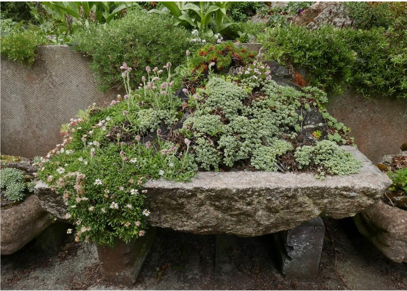
Erigeron and Raoulia dominate the front face of this slate landscaped granite trough