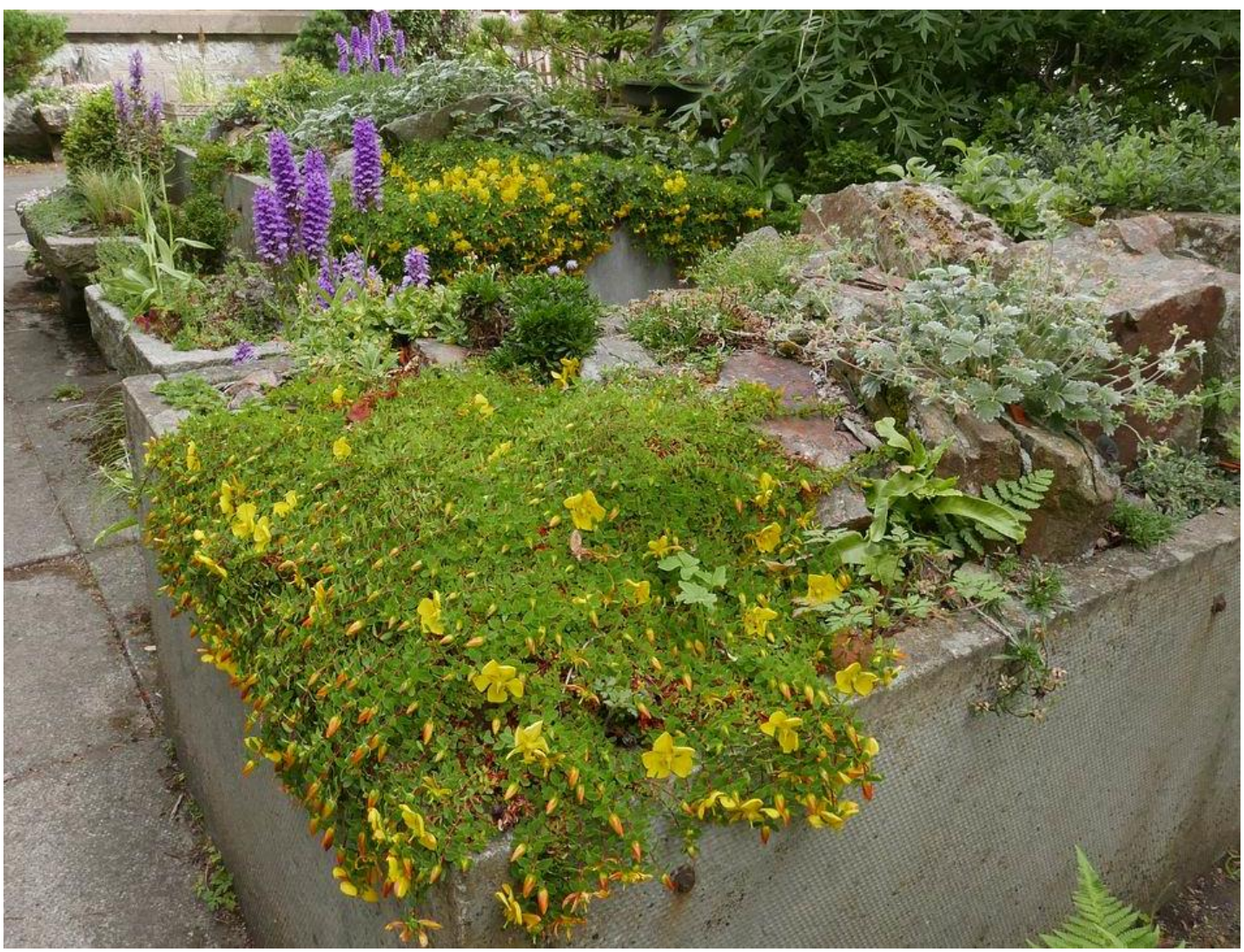
Slab beds with Hypericum reptans.