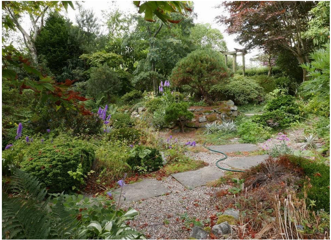
Many of the plants are under severe stress from the long drought we are experiencing. Flowers are lasting a very short time and many plants that would remain green throughout our typical cool moist summers are drying up and retreating underground.

A constant flight of bees is visiting the flowers of Hypericum reptans which are enjoying the warm weather.