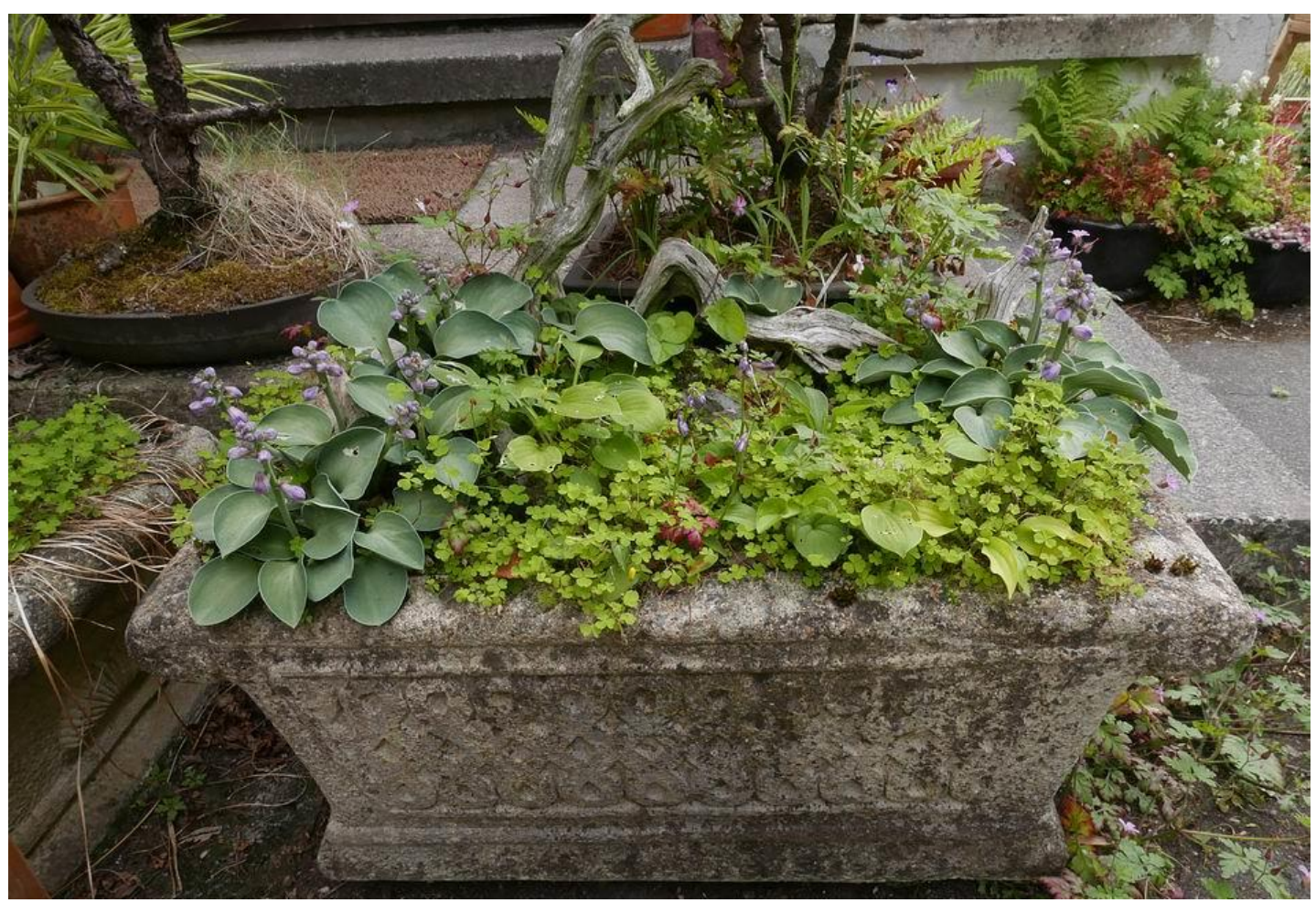
This trough planted with dwarf Hosta is also populated with compatible self-seeders.