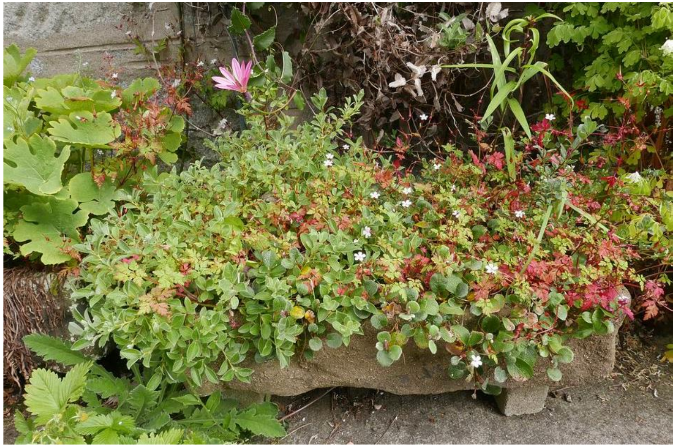
This trough is planted up with low growing and matt forming Salix into which Geranium robertianum has seeded.