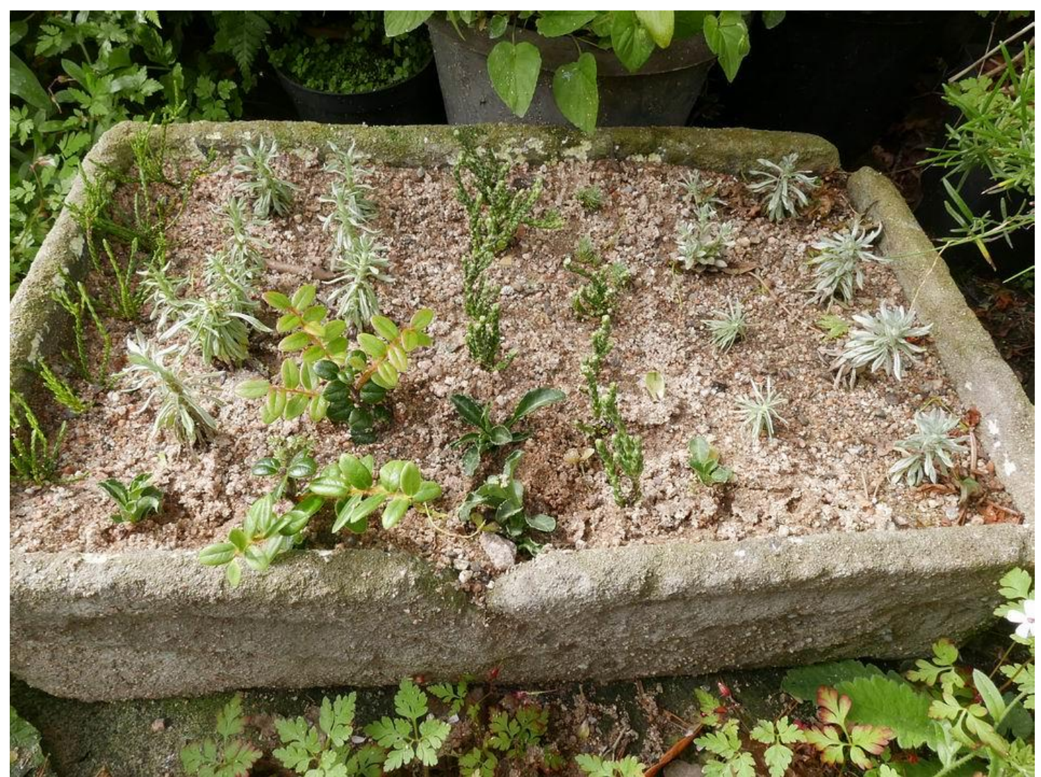
These rooted cuttings are now placed, along with others, into one of the sand boxes that I use – they will stay there for a few more weeks to harden off before being planted directly into the garden. You can also see the few cuttings of Campanula nitida shown in a previous picture that had a few roots.